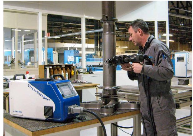
Portative equipment for in and ex-situ services (here: helicopter rotor vertical shaft)