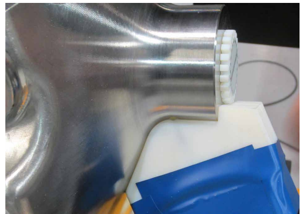
Hermetic in-house designed chamber to be specifically adapted to the treatment area