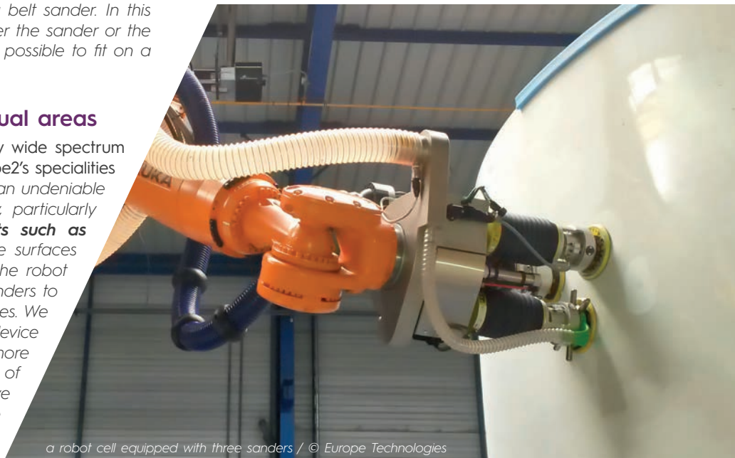
a robot cell equipped with three sanders

Robotisation allows for a very wide spectrum of applications, as one of Gebe2's specialities illustrates: 'We have acquired an undeniable body of expertise in industry, particularly in sanding very large parts such as airplane engine pods . As the surfaces to be treated are extensive, the robot cell is equipped with three sanders to limit the time the operation takes. We have also created a different device for a more complex and more subtle operation: the sanding of air intake lip skins. To achieve perfect homogeneity, the robot has to take account of the initial deformation